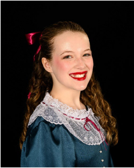
Party Girl Example